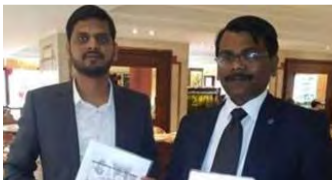
CROPIN TECHNOLOGY & IACG SIGN MOU TO SUPPORT SUSTAINABLE AGRICULTURE