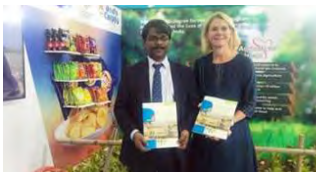
SOCIO-ECONOMIC IMPACT ASSESSMENT OF PEPSICO'S INITIATIVES