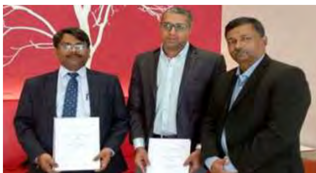
IACG SIGNED OFF AN AGREEMENT WITH FARM LOGICS TO WORK TOGETHER BOTH IN ASIA