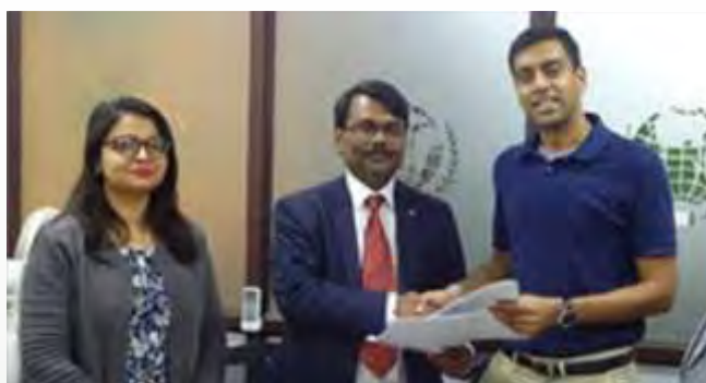
IACG SIGNS MOU WITH ASSIST HEADQUARTERED AT PHILIPPINES