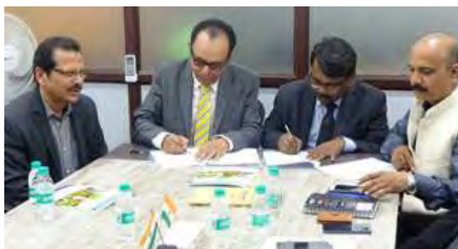
IACG SIGNED MOU WITH US BASED GLOBAL AGRI BIO LINKAGES INC